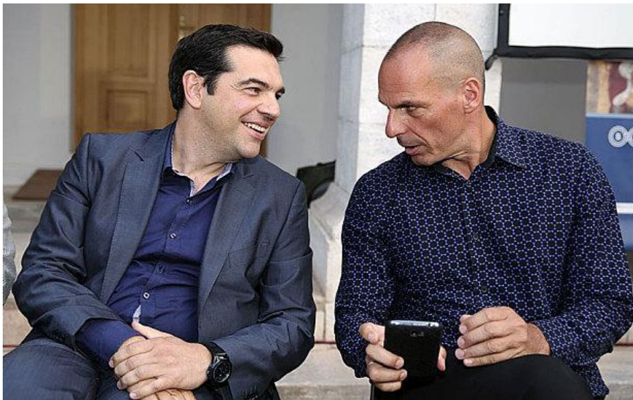
Yanis Varoufakis (right) with Prime Minister Alexis Tsipras

Syriza took a battering ram to troika's austerity policies but barely made a dint in the castle walls. The Tsipras-Varoufakis good cop/bad cop theatre was probably their only chance of success but it needed to be carried through to its logical conclusion, and Tsipras shied at the last post. The Greek crisis is by no means finished; most economists agree with the IMF that the current deal cannot work without a major debt haircut. It is early days yet to gauge whether the very public brutal treatment of Syriza has succeeded in warning off other European anti-austerity parties such as Podemos ('We Can') in Spain. What lesson they take—except perhaps that it is best to avoid full confrontation—is still being worked out: http://www.telegraph.co.uk/finance/economics/11758853/Why-Greeces-ritual-humiliation-wont-kill-off-Europes-revolutionary-Left.html